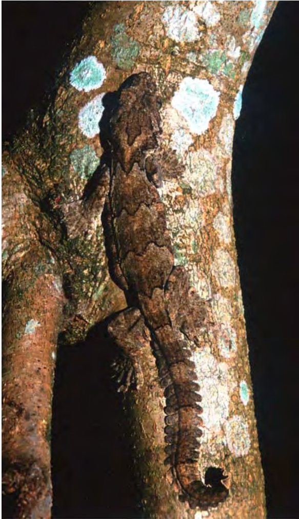
Figure 2. Ptychozoon lionotum (Adult female, BNHM 1445) from Mizoram, northeast India.

On 6th April 1999, SP, along with his field assistant, spotted the second Ptychozoon at 1820 hrs, next to a dirt track in a patch of mature evergreen forest south of NWLS boundary, ~40 km (straight-line) south of the first locality. NWLS is the only remaining patch of unfragmented, mature primary forest in the area, characterized by a three-tiered structure, with towering, buttressed, deciduous emergents up to 50–60m in height, followed by middle and tertiary canopy trees (Pawar, 1999). This area, especially the Ngengpui valley, experiences five rainless months, but the effective dry period is much shorter, with humidity being consistently high during these months due to fine, localized precipitation from cloud and fog. This individual was smaller than the first one and was spotted at a height of 5 m on the trunk of a Sterculia scaphigera tree. The tree is characterized by a deeply fluted trunk and a smooth but slightly flaking bark, and occurs as a deciduous canopy-emergent in pri-